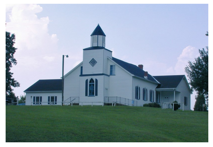
Blue Run Baptist Church (Est. 1766) included African Americans among its founding members.